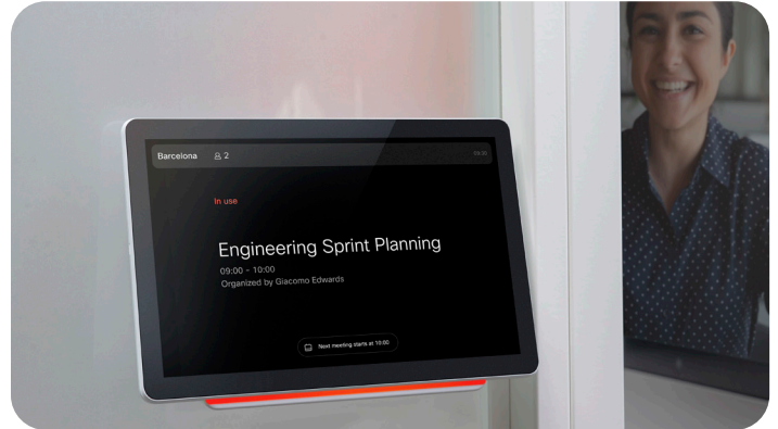
Figure 3: Webex Room Navigator deployed as room scheduling display

With the Webex approach to room controls and space reservation, you can significantly simplify your deployment, lower total cost of ownership and ease management efforts by leveraging a single vendor to provide platform agnostic video collaboration devices, the underlying meeting service, the room control hardware, and the associated room booking software solution.