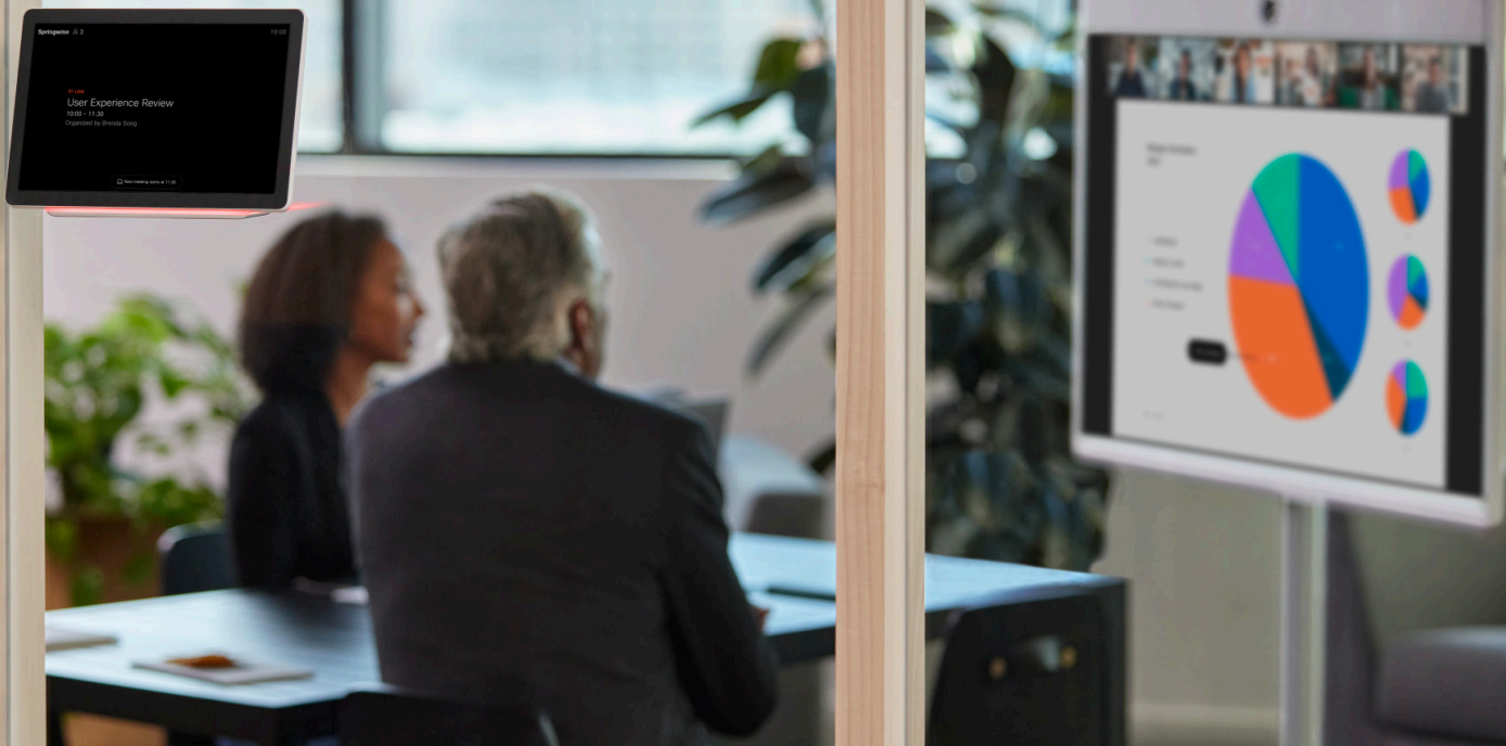
Figure 1: Webex Room Navigator unit mounted on glass wall showing meeting room availability

Transform your workplace with simple and intelligent experiences while eliminating the friction from the employee journey. The wall-mount Webex Room Navigator touch panel is designed to bring ease and convenience into modern workspaces by providing instant access to conference controls, smart room booking, room controls and your go-to workplace applications.