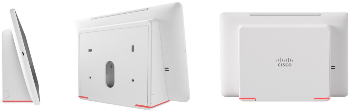
Figure 5: Rear and side views of the Room Navigator

The list above reflects the regulations applicable at the time of publishing this document. For an updated list of regulations applicable, see the Product Approval Status Database for approval documents per country