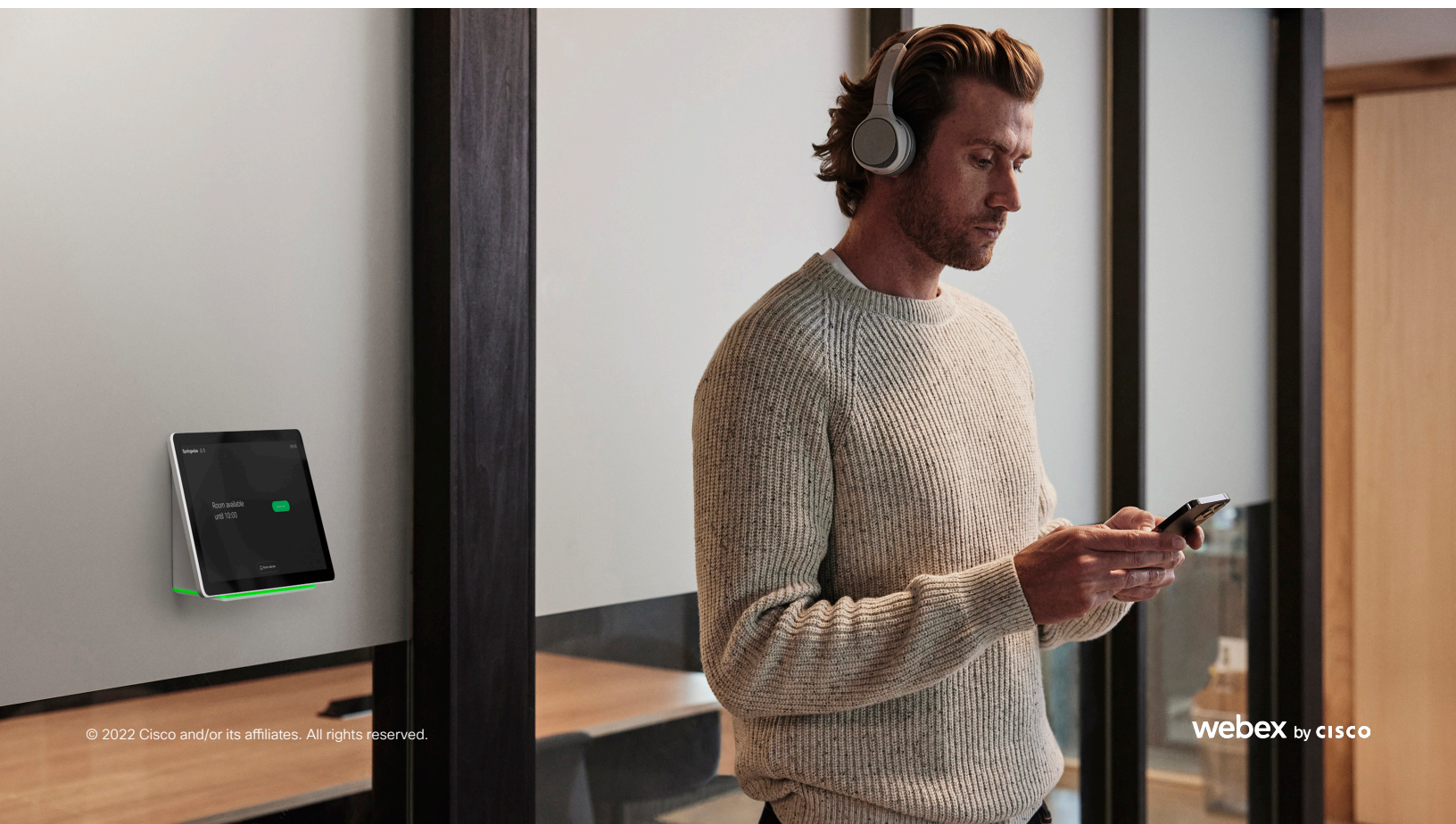
Figure 2: Webex Room Navigator mounted on glass wall, displaying room availability and allowing for instant room booking

Webex Room Navigator is a competitive, feature-rich and highly flexible solution that can be used either that can be used either as a room and conference control panel or a dedicated scheduling display, has a robust device management platform, and offers rich sensor data that supports creating a safer and optimized workspace environment.